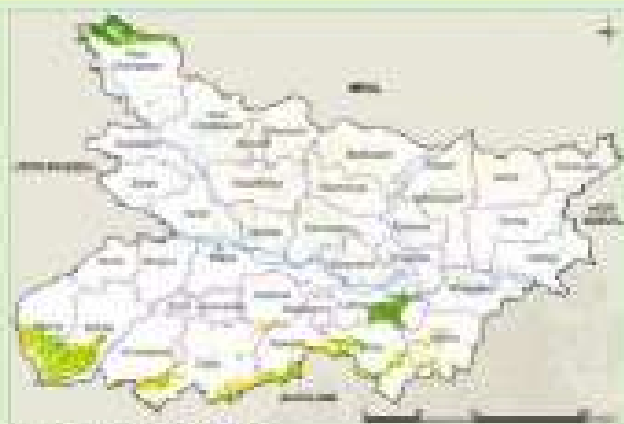
Source: Forest Survey of India, 2020

Bihar has a total forest cover of 7.84% (7380.79 Sq.km) of its total geographic area (94,163 Sq.km), according to the Forest Survey of India (FSI) India State of Forest Report 2020.